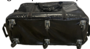
Wheels base option