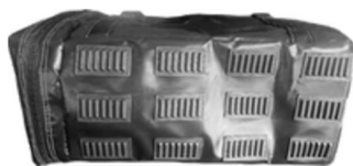
Lug bumpers base option

This product is customizable in print, size and colours.